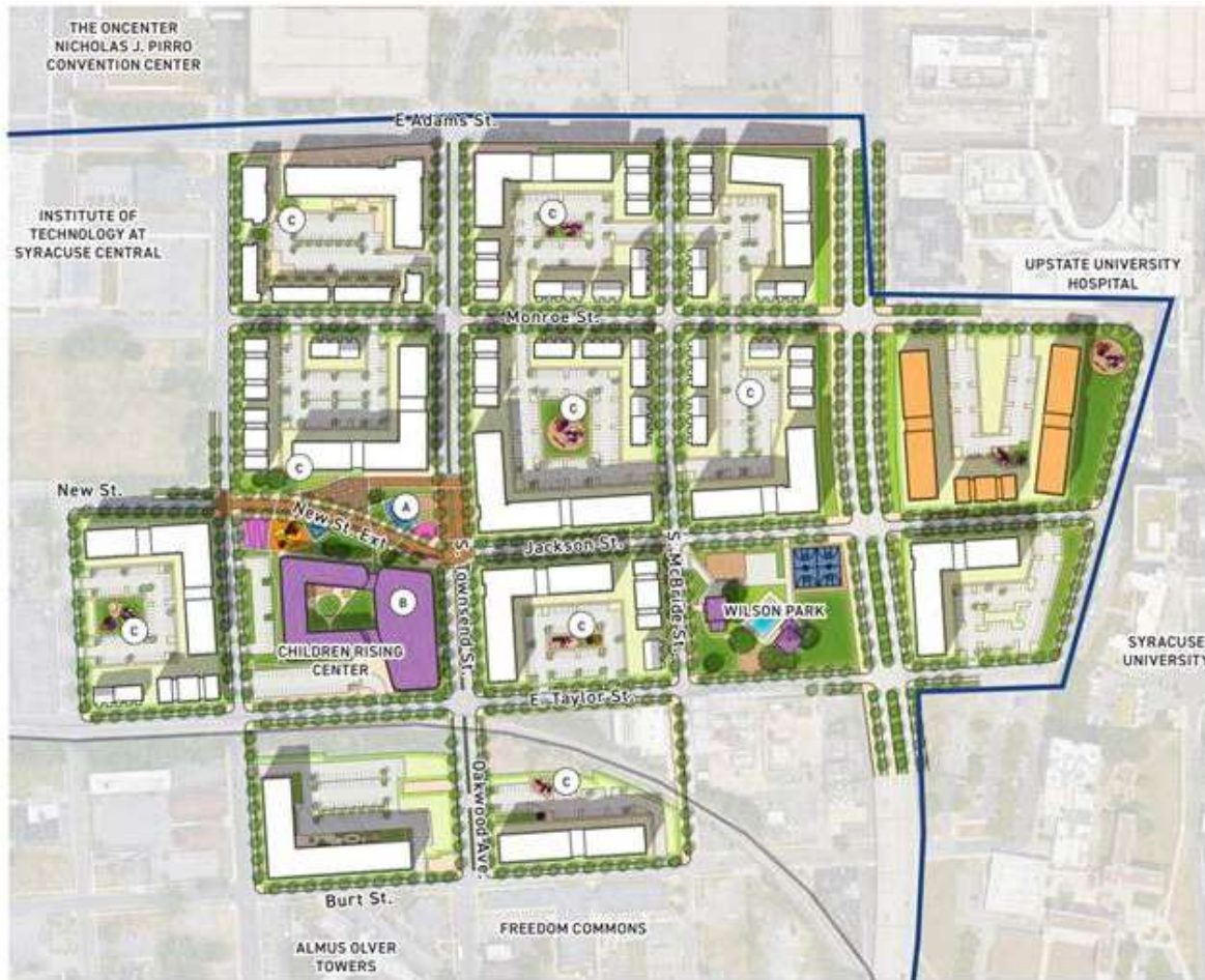
Fig 1. Conceptual Site Plan Design